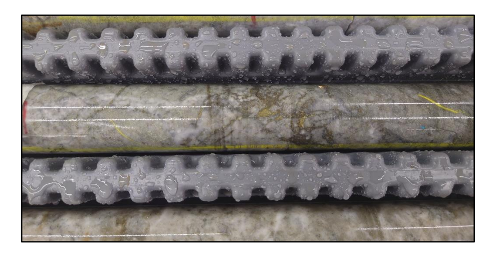
Figure 1: Photo of hole 23DO07 drill core showing alteration and textures common to the highest-grade gold mineralization. Shown is an ~40 cm interval from within a 1 metre interval grading 113.40 g/t Au.

Gold-bearing intervals in drill core at Donut comprise zones of intense silicification, sericitization, and pyritization within a variably sheared tonalitic intrusive body. Visible gold is observed locally associated with extensional-type quartz/quartz-carbonate veining.