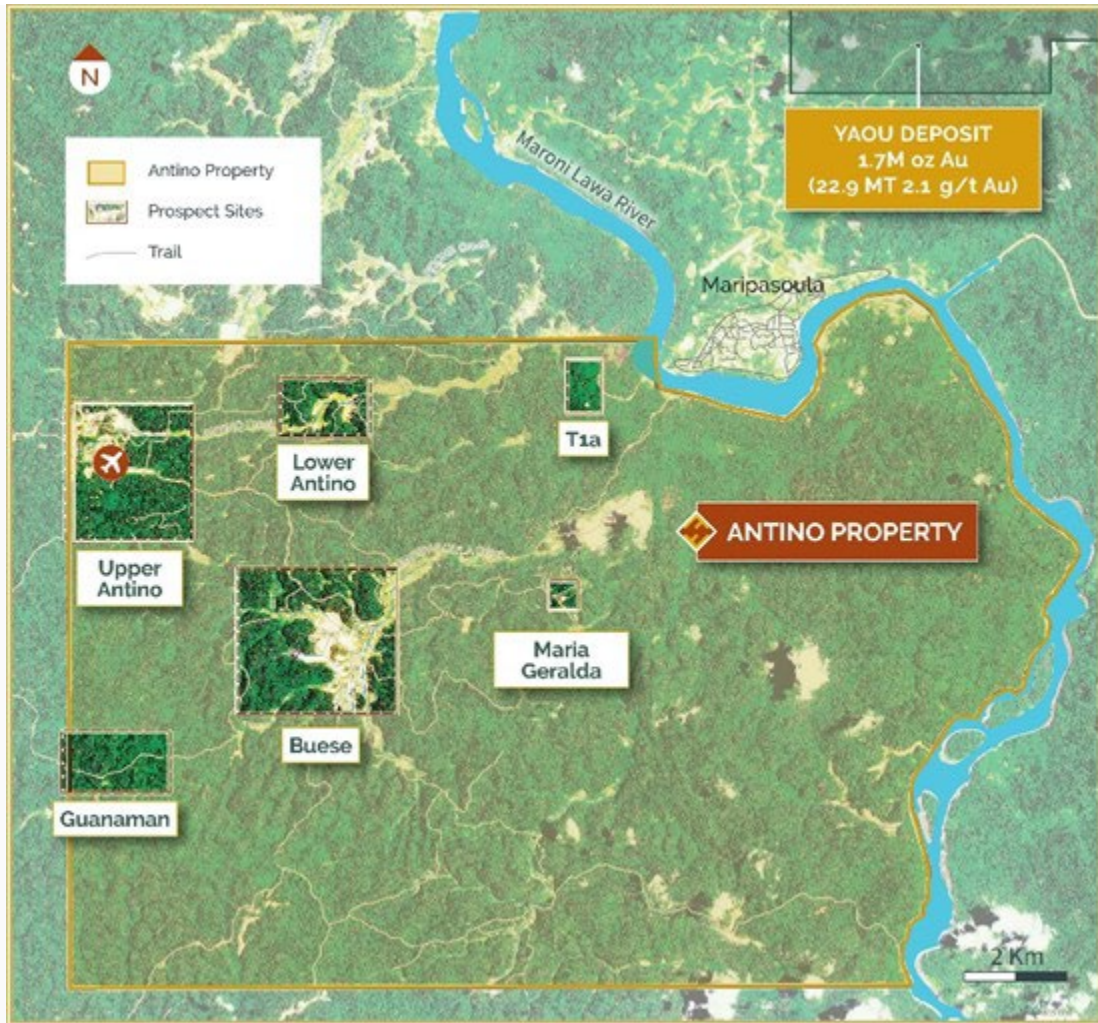
Figure 4: Antino Gold Project property map.

To view an enhanced version of this graphic, please visit: