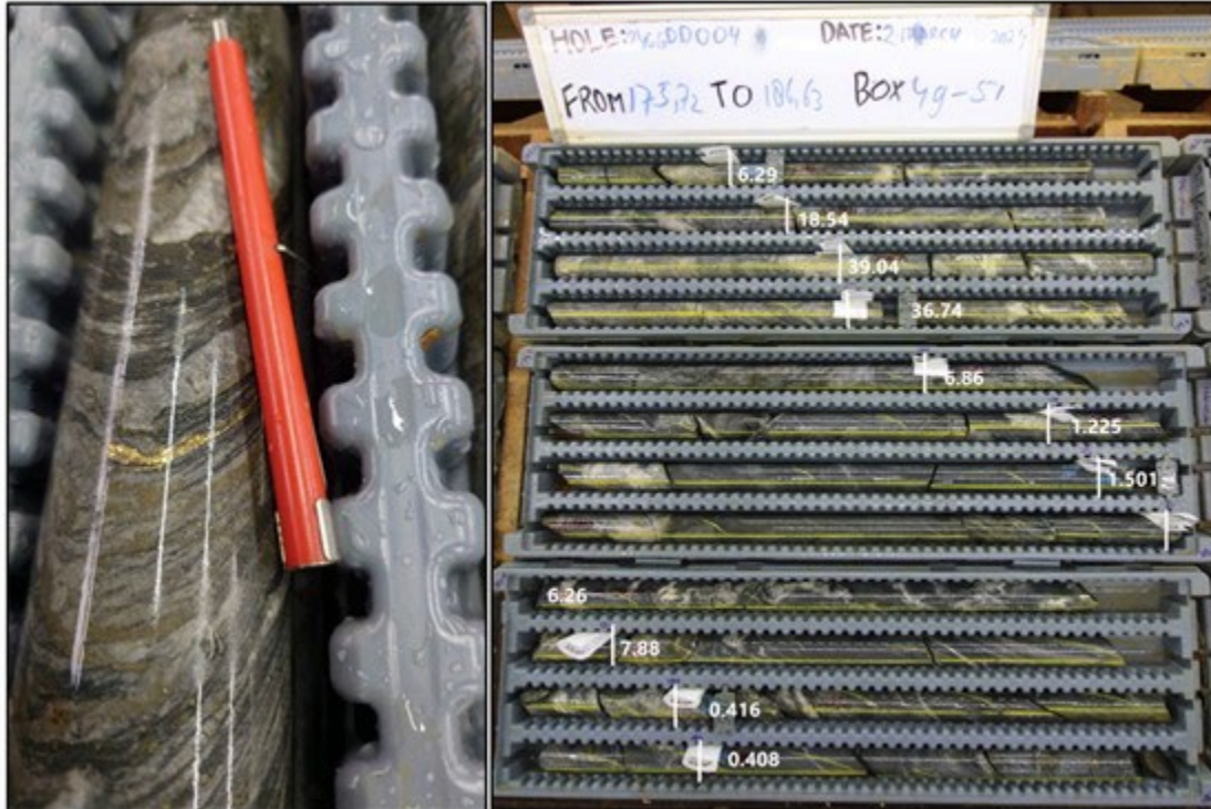
Figure 3: (left) gold vein in drill core from hole 24GG04. (right) Drill core from hole 24GG04 showing typical textures within mineralized zones at Froyo. Core locally contains up to 35% pyrrhotite and pyrite within a zone of high-intensity shearing.

To view an enhanced version of this graphic, please visit: